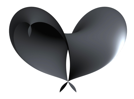
Figure 5. The surface generated by Bernoulli's Lemniscate (x^2 + y^2)^2 = x^2 - y^2 . The cusp lines meet at the center of the figure eight, where the curvature of the plane curve is zero (compare Figure 4).

In the same way, taking the parameterizations